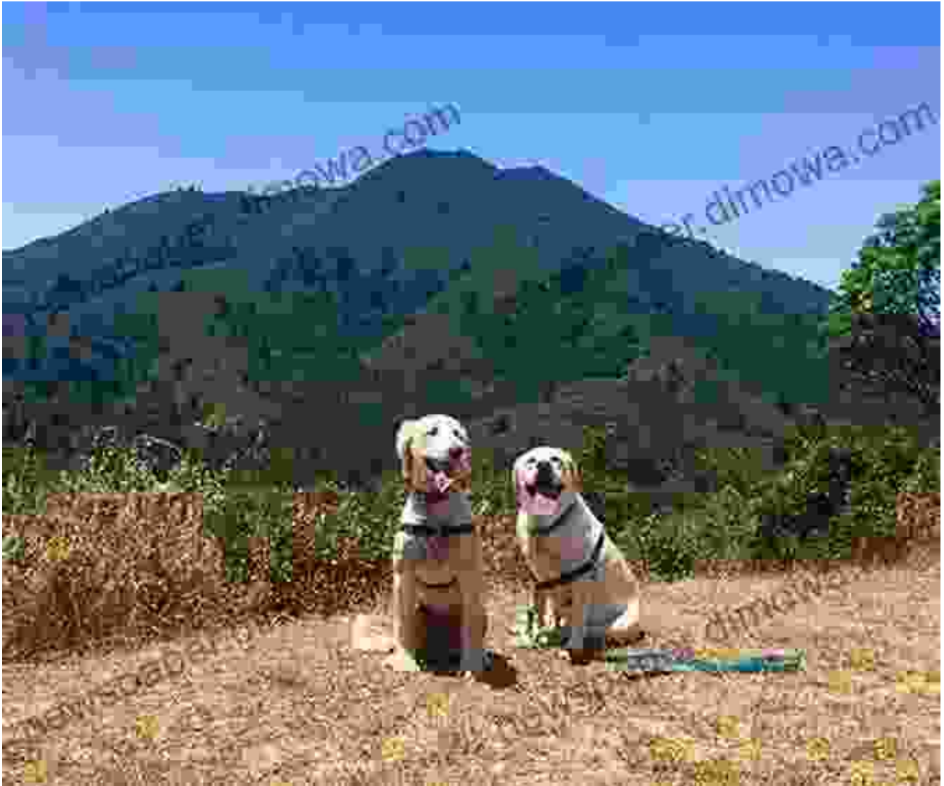
Mount Tamalpais State Park