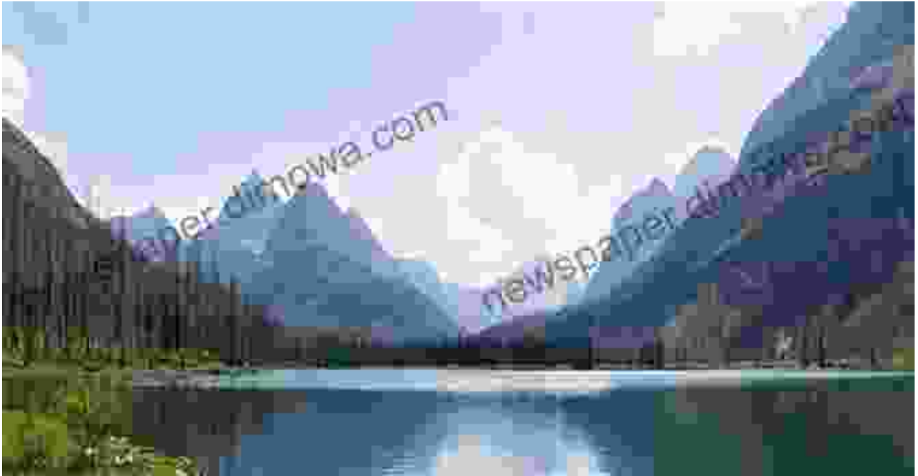
Red Eagle Lake: A serene escape