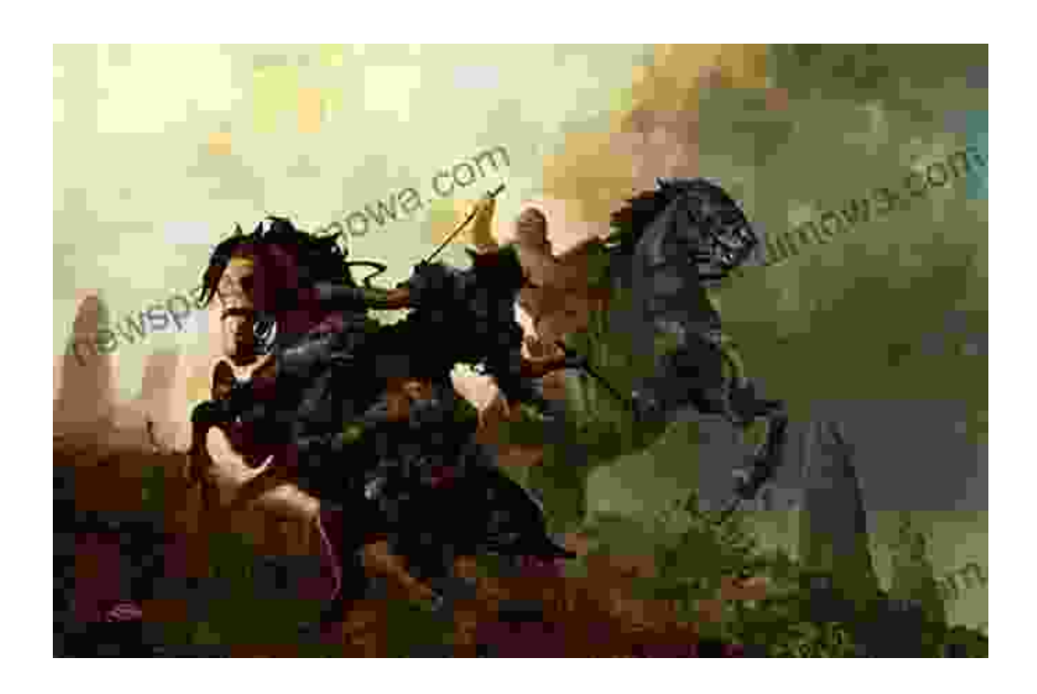
A Masterpiece of Fantasy that Will Stay with You Long After You Finish Reading

"Outcasts: The Safe Lands" is more than just an adventure story. It's a timeless tale that explores universal themes of courage, betrayal, and redemption. Through the trials and tribulations faced by the characters, you'll discover the strength of the human spirit and the importance of fighting for what you believe in, even when the odds are stacked against you.